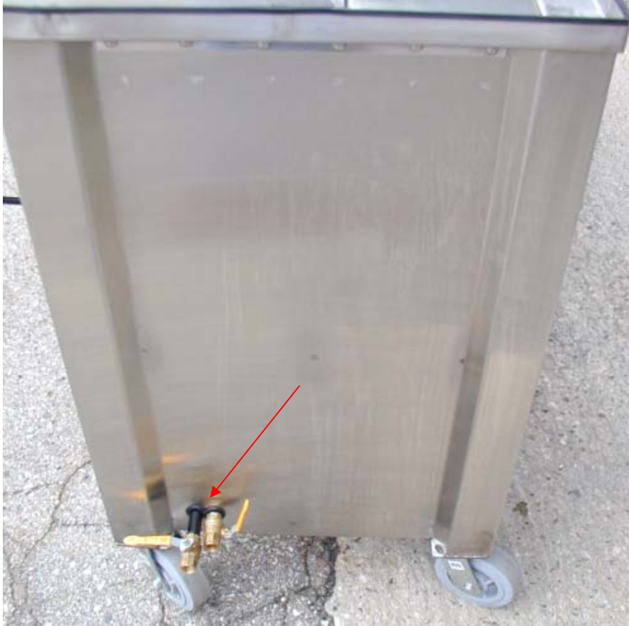
Drain Valves 1 for Rinse Tank and 1 for Cleaning Tank